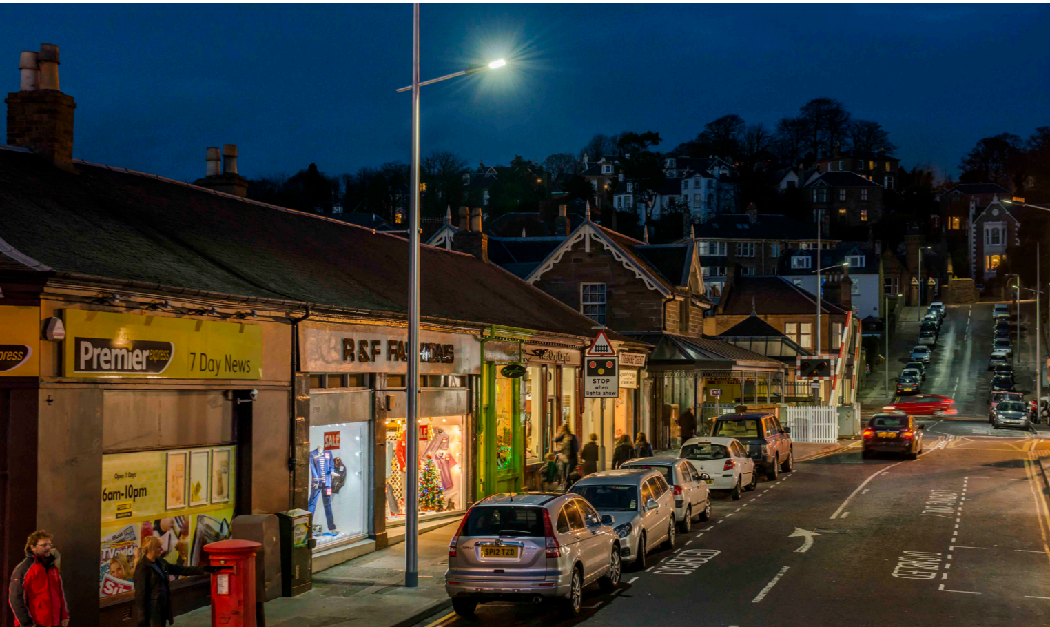
The LED solution installed has provided superior light quality that has helped to enhance safety and security.